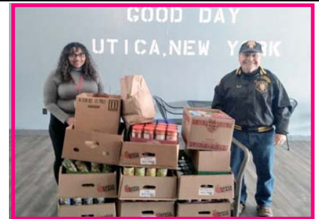
Utica Assembly 733 Easter donation to the Veteran's Outreach Center